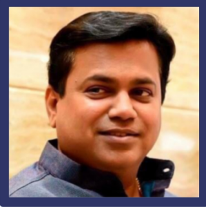
Shri. Uday Samant

Hon'ble Minister Higher & Technical Education