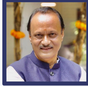
Shri. Ajit Pawar