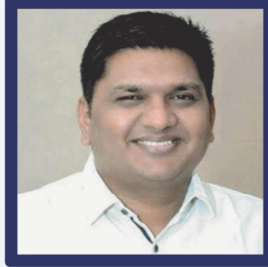
Shri. Prajakt Tanpure

Hon'ble Minister Higher & Technical Education