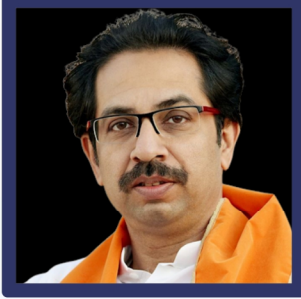
Shri. Uddhav Thackeray